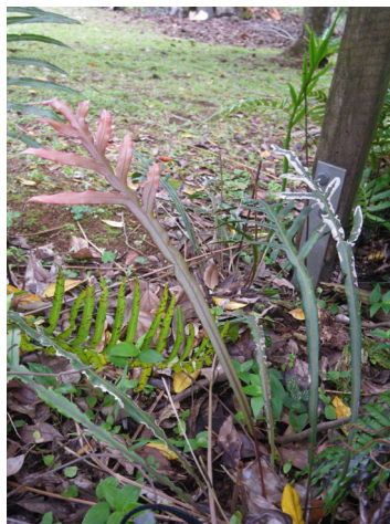
Pink new growth