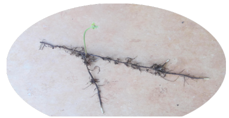
Long-running and branching rhizome